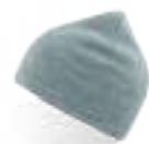
LT GREY MELANGE