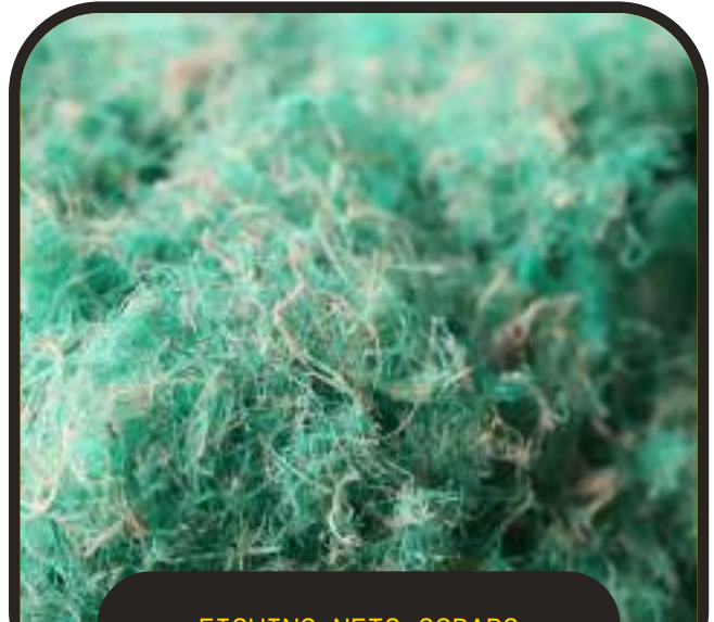
FISHING NETS SCRAPS