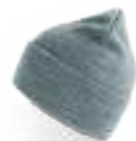
LT GREY MELANGE