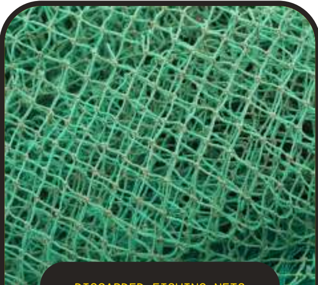
DISCARDED FISHING NETS

into 100% recycled PE ReTraze® fishing net panels. The recycling process employed by ReTraze® involves physical methods, including sorting, cutting, washing, melting, chipping, extrusion, and precision cutting. Through their efforts, they not only reduce waste, but also create a product that stands testament to the potential of responsible recycling.