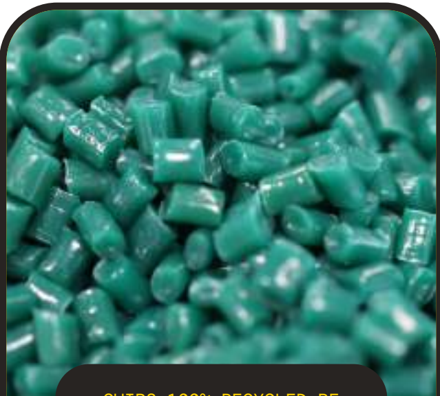
CHIPS 100% RECYCLED PE